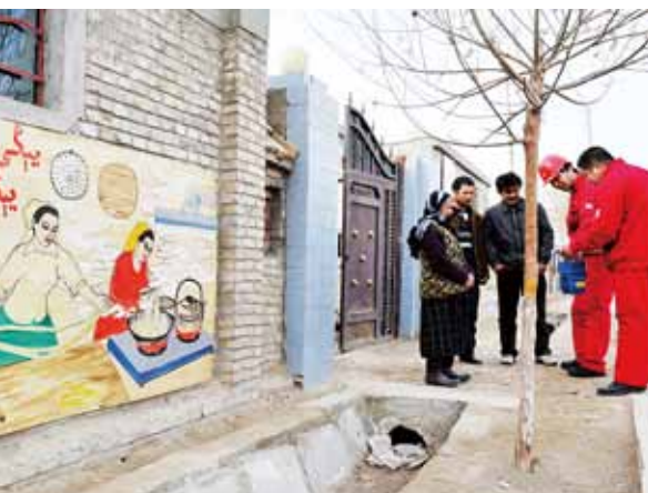
Kokia operating area pipeline inspection