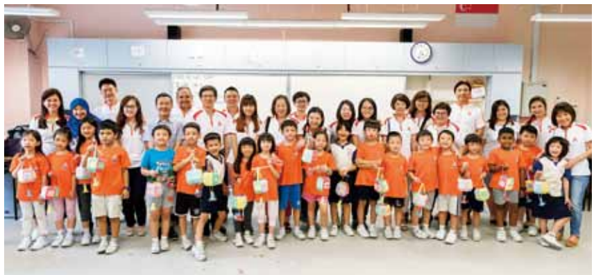
Launched "The Boys' Brigade Share-a-Gift" (BSBG) in Singapore