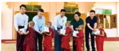
Donated school supplies for children of monk school in Myanmar