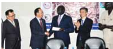
Donated earthquake relief funds to South Sudan