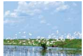
Biological waste water treatment system in the 124 district oilfields in Sudan is the largest of its kind to treat waste water from oilfields with biomass and plants.