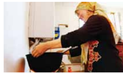
Residents in Hotan, Xinjiang, use clean natural gas