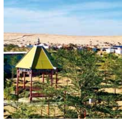
A corner of green space in the desert camp

By adopting state-of-the-art water saving technology of the industry such as waste water reuse, our refinery in Niger has saved a total of 2.876 million tons of fresh water by the end of 2017. It has invested 2 million dollars in the building of camp waste water treatment station, which has become functional in March, 2017. It has realized recycling and reuse of waste water, and will save 94,000 tons of ground water used for green space.