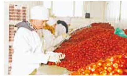
Natural gas promotes the rapid development of local economy

Natural gas has not only changed people's lifestyle in southern Xinjiang, but also improved the ecological environment and promoted local socio-economic development.