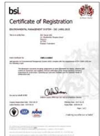
Yamal Project was re-certified under ISO 14001 and OHSAS 18001, which is valid until June 2020.