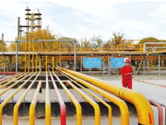
Security patrol in Kashgar oil and gas operation center

Beijing Marketing Company of CNPC joined hands with Beijing Municipal Environmental Protection Bureau to carry out the "Clear Air and Green Driving" environmental protection campaign at the Company's service stations. Our youth volunteer teams have been honored with titles such as Beijing Model Stations for Volunteer Services. Dalian Petrochemical Corporation established the volunteer association, and organized its employees to clean up marine litter. CNPC Shandong Marketing Company provided break rooms at service stations for sanitation workers and launched work experience days to raise public awareness of respecting and caring about sanitation workers.