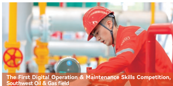
The First Digital Operation & Maintenance Skills Competition, Southwest Oil & Gas field

As of the end of 2023, the Company had 257 high-level experts and 353 skilled masters and skilled experts. The Company has established 128 corporate skilled expert workshops, including 34 national skilled master workshops.