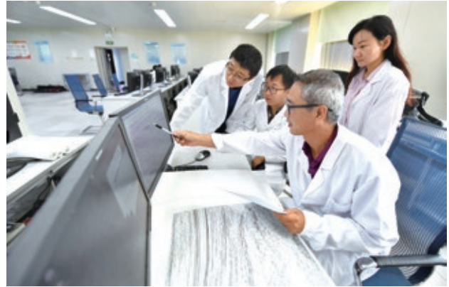
Researchers tackling technical problems

We saw overall progress in technology platforms. The Big Data Security Research Center of Petroleum and Petrochemical Industry, as part of the National Engineering Big Data Security Lab, was set