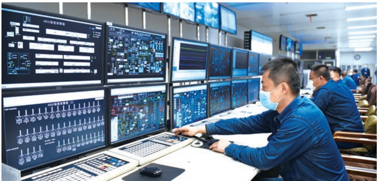
Daqing Refinery Control Center