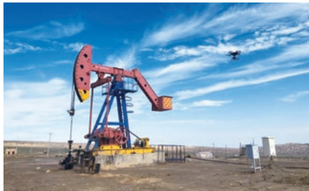
Drones used in Yumen Oilfield for production site inspection

The Company has implemented digital transformation in three main areas, i.e. business development, management reform and technological empowerment, and introduced an integrated, two-tier strategic framework by creating the application ecosystem centered on Industrial Internet technology system and cloud platform. The Internet, big data and artificial intelligence have become an integral part of the Company's business operations to facilitate digital transformation and intelligent operation in the form of intelligent oil/gas fields, intelligent refineries and chemical plants, smart marketing, and intelligent engineering.