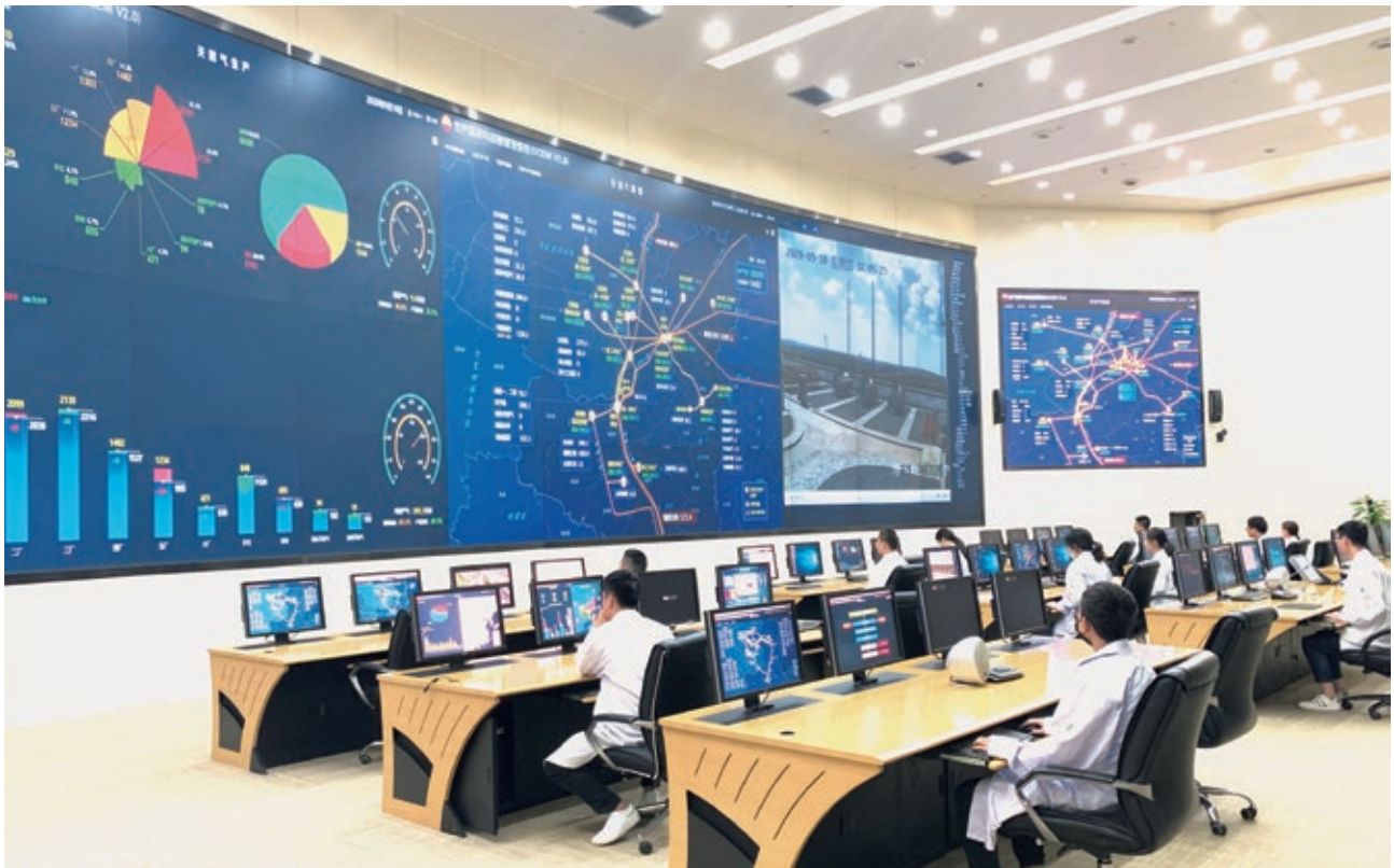
Changqing Oilfield Digital Command Center

Frontier Technology: The Company has been developing new theories, methods and technologies in line with strategic development needs of the future and international technological development trends. Breakthroughs in understanding the mechanism of deep/ultra-deep oil and gas accumulation, and research on new geophysical evaluation technologies were achieved to provide support for deep E&P and EOR activities; geological theories on the accumulation and enrichment of continental shale oil were developed to guide and propel the continental "shale oil revolution"; theoretical understanding and core technology in nano-flooding, carbon dioxide flooding, and smart injection and production made important headway to improve effectively the recovery and producibility of low-permeability oilfields and high-water-cut oilfields. R&D efforts were organized to debottleneck technologies under study regarding new-generation high-value-added synthetic materials and products, and natural gas-based high-value-added chemicals, and to deploy a pre-emptive technical reserve for new chemical materials; major breakthroughs were made in high-end polyolefin materials for medical applications.