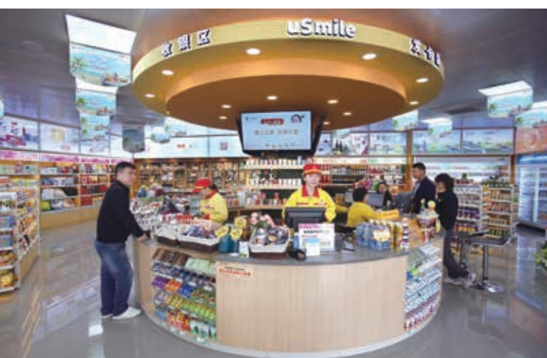
uSmile convenience store in service station

The sales of our miscellaneous refined products recorded a historical high of 33.90 million tons in 2017, an increase of 540,000 tons from the previous year. We sold 8.53 million tons of asphalt, 1.41 million tons more than the previous year and taking a 28% share in the domestic market, number one among the players. And the sales to end-users accounted for 59% of the total, up 42% year-on-year, marking a record high.