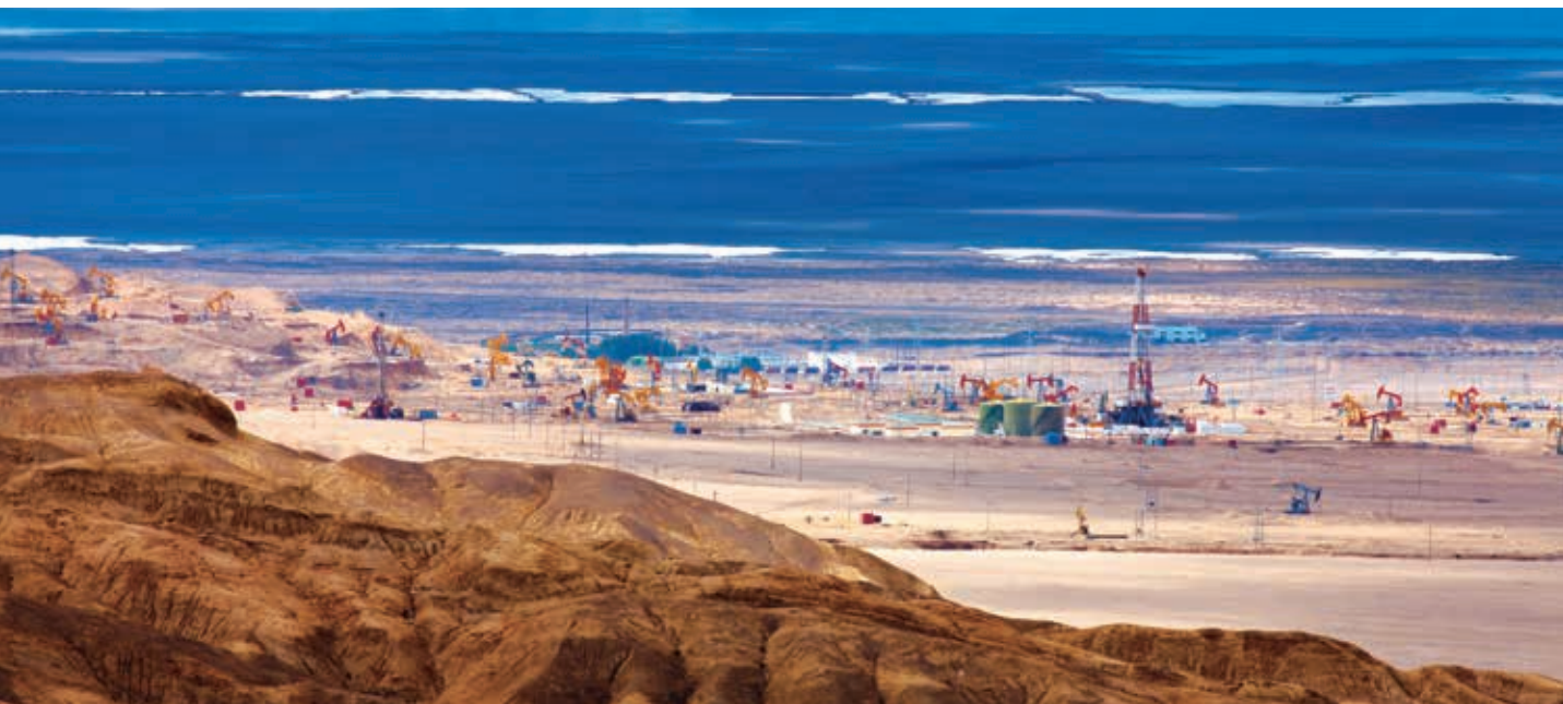
Gasi Oilfield in Qinghai Province

Changqing Oilfield, China's largest natural gas production base and a reliable source for the Shaanxi-Beijing Gas Pipelines, yielded 36.9 billion cubic meters in 2017, over one-third of CNPC's total domestic production. Tarim Oilfield produced 25.3 billion cubic meters of natural gas in 2017, thanks to accelerated implementation of key projects in Kuqa area, such as high-efficiency development of natural gas, and efficient development of carbonate gas fields, and key capacity building programs in Keshen and Tazhong. Gas production of Southwest Oil and Gas field reached 21 billion cubic meters, standing above 20 billion cubic meters for the first time. Qinghai Oilfield managed to maintain steady production in mature blocks and ramp up production in new areas, as a result of synergy in enhanced gas recovery and capacity building measures. Progress was made in natural gas development in the Songliao Basin. Gas production grew steadily in the Daqing, Jilin and Huabei oilfields.