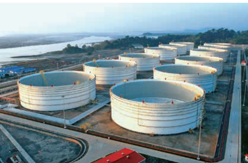
Oil tanks under construction in Maday Island, Myanmar

The Second Russia-China Crude Pipeline starts at Mohe in Heilongjiang, crosses Inner Mongolia, and ends at Daqing in Heilongjiang. In parallel to the existing Russia-China Crude Pipeline, it has a total length of 932 kilometers, pipe diameter of 813mm, designed pressure of 9.5-11.5 MPa, and designed annual capacity of 15 million tons. The pipeline started to be constructed on July 20, 2016 and became commercially operational on January 1, 2018. Under the agreement between CNPC and Rosneft on the increase of oil supplies, Rosneft will deliver another 15 million tons of crude oil to China every year through the Second Russia-China Crude Pipeline.