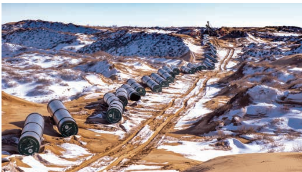
The Fourth Shaanxi-Beijing Gas Pipeline under construction

In 2017, our three LNG terminals in Jiangsu, Dalian and Tangshan offloaded a total of 10.42 million tons of LNG, up 84.3% year-on-year, playing an increasingly important role in peak shaving. Our 24 LNG plants in Hubei, Sichuan, Shaanxi and other provinces are capable of liquefying 22.86 million cubic meters of natural gas per day, with annual LNG capacity accounting for about one-fifth of China's total.