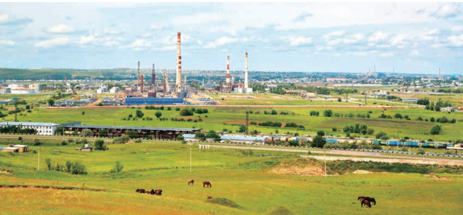
Shymkent Refinery in Kazakhstan

In addition, CNPC and Eni signed an agreement on cooperation in E&P, natural gas and LNG, trade and logistics, refining and chemicals areas. CNPC and Cheniere Energy signed an MOU on long-term LNG sales and purchase, to strengthen LNG cooperation in the Gulf of Mexico and facilitate long-term sales and purchase of LNG between the two countries.