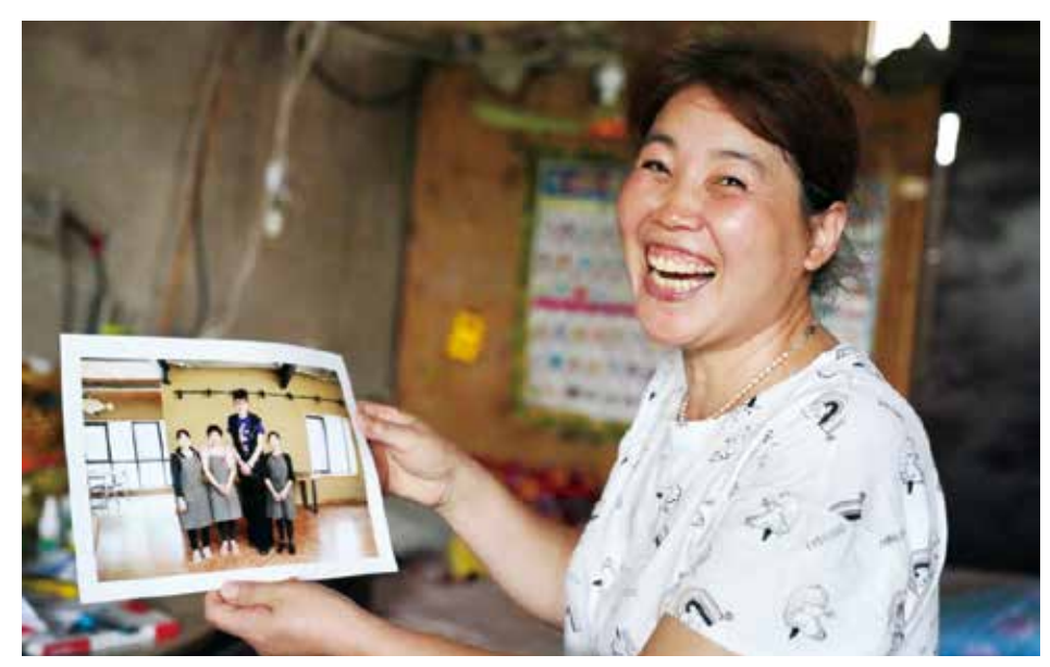
CNPC initiated a rural tourism project for poverty alleviation – "Vernacular B&B Town alongside Yellow River" in Jiangzhuang Village, Taiqian County, Henan Province. The project has brought a more attractive environment, smoother roads and better life to local residents.

At the Poverty Alleviation Commendation Conference hosted by the State Council Leading Group Office of Poverty Alleviation and Development, CNPC was awarded the "National Award for Innovation in Poverty Alleviation" for its outstanding contributions to poverty eradication.