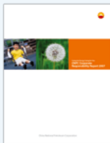
CNPC Corporate Responsibility Report 2006

For more information about CNPC's sustainable development and the fulfillment of its social responsibilities, you can read our CSR reports of previous years, which can be downloaded from our website.