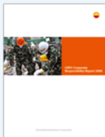
CNPC Corporate Responsibility Report 2008