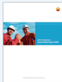
CNPC in Kazakhstan Sustainability Report 2008