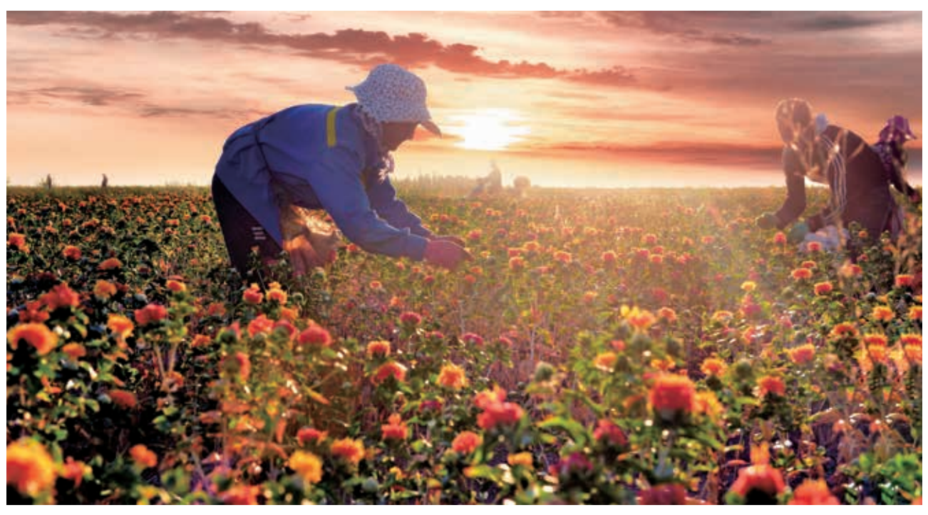
The Safflower Industrial Park invested by CNPC in Qapqal County, Yili, Xinjiang