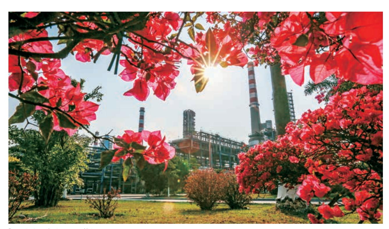
Forestation in production areas and living quarters

We support and partake actively in the construction of carbon sink forest and forestation activities in China. The company established the China Green Carbon Foundation together with the State Forestry Administration for ongoing efforts in that regard. Meanwhile, we set up the Forestation Committee to ensure continuous forestation in our production areas and living quarters. As of 2019, CNPC's green coverage reached 286 million square meters. The company's forestation activities attracted 499,000 participants to plant 2.027 million trees throughout the year.