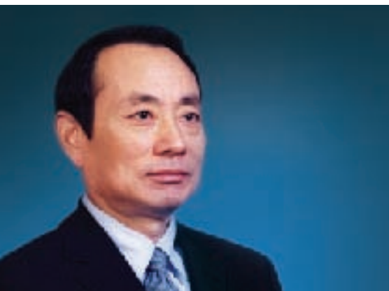
President of China National Petroleum Corporation Jiang Jiemin

Along with the in-depth implementation of the reform and opening policy, China has entered a new stage in this era of economic globalization. The continuous fast growth of the Chinese economy has brought about a vast development space as well as complicated challenges for CNPC. In the changing environment, how to harmonize fast development with resources, environment, society and staff development while successfully transforming the development model is the key issue to be tackled by CNPC and its staff.