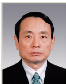
Jiang Jiemin Vice President